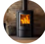
Energy-efficient Fireplaces & Stoves