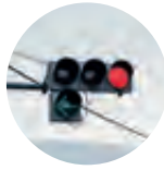
Traffic Lights and Controllers