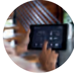
Wireless Automation Devices