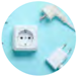
Sockets and Plugs